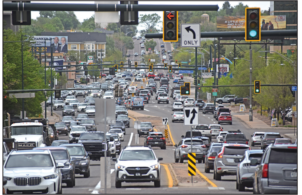
Traffic: Daily gridlock on Colorado Boulevard illustrates the corridor's already severe congestion challenges. Critics of CDOT's proposed Bus Rapid Transit (BRT) project, slated for construction around 2030, warn that eliminating two vehicle lanes could worsen traffic backups, increase idling times, and lead to higher vehicle emissions and air pollution along one of Denver's busiest corridors.

highway, the Colorado Department of Transportation (CDOT) apparently has the final say in consultation with the Federal Transit Administration, which oversees the federal environmental review process and provides potential funding avenues.