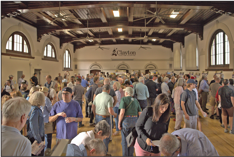
Packed House: The Colorado Department of Transportation hosted its second open house for the Colorado Boulevard Bus Rapid Transit (BRT) Project on Wednesday, May 13, to share project information, respond to questions and obtain feedback on potential options for improvements along the corridor.

The Glendale City Council voted unanimously (5-0) to oppose BRT along Colorado Boulevard, rejecting all three of the so-called preferred alternatives along the road. Since Colorado Boulevard is a federal