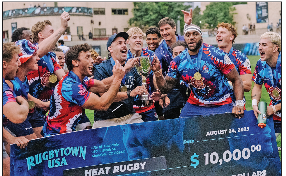
Tough Competition: In the 2025 Cup Final, Heat Ruby won their first RugbyTown 7s Cup and the $10,000 prize when they defeated NAV 7s.