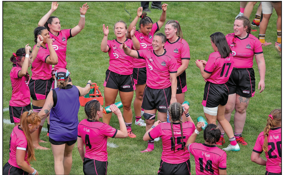
Home Turf: The Denver Onyx, who compete in the Women's Elite Rugby league, will play the Chicago Tempest at Infinity Park on June 7.