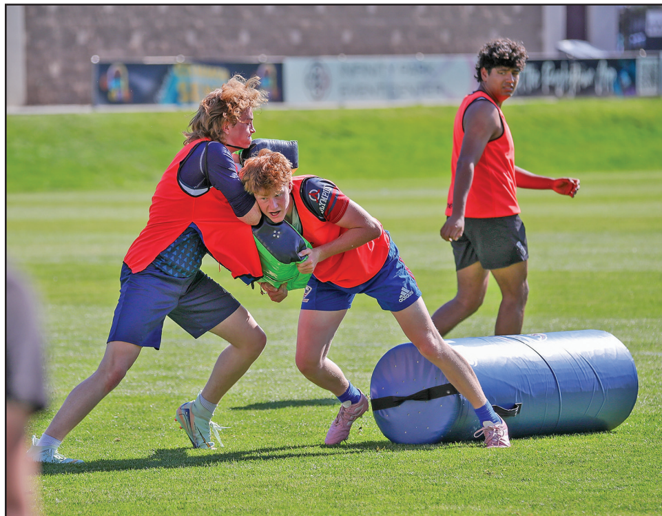
Skills Camp: Hosted by Glendale Youth Rugby, the boys high school camp is slated for July 14-17 at Infinity Park.

Fans attending the tournament can expect to see 57 matches played over the course of three days in August. The Early Bird Special for 20 percent off weekend passes and single day tickets will be available July 13-3 and regular tickets will go on sale August 1. More information on the Denver Onyx can be found at DenverOnyx.us . For additional information about RugbyTown 7s, visit RugbyTownUSA.com . Those interested in learning about the Glendale Youth Rugby high school camps can visit GlendaleYouthRugby.com/high-school-camps .