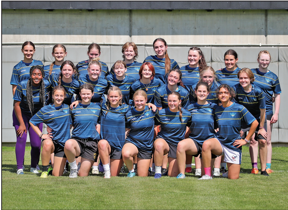
Elite Experience: Glendale Youth Rugby will host a four-day skills camp for high school girls June 21-24.