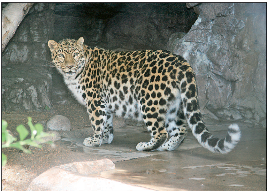
Immediate Attraction: After Calvin Klein Obsession for Men cologne was sprayed in her exhibit, the female Amur leopard was immediately attracted to the areas where the scent could be found.

According to the Wildlife Conservation Society, when sprayed on a tree or rock the cologne can draw a wild cat from more than half a