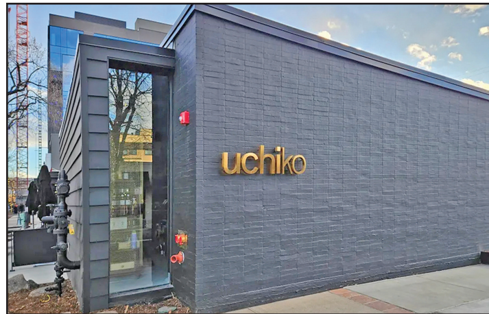
Sushi Sensation: After a four year wait, sushi chain Uchiko — featuring lunch and happy hour specials — has opened in Cherry Creek North.