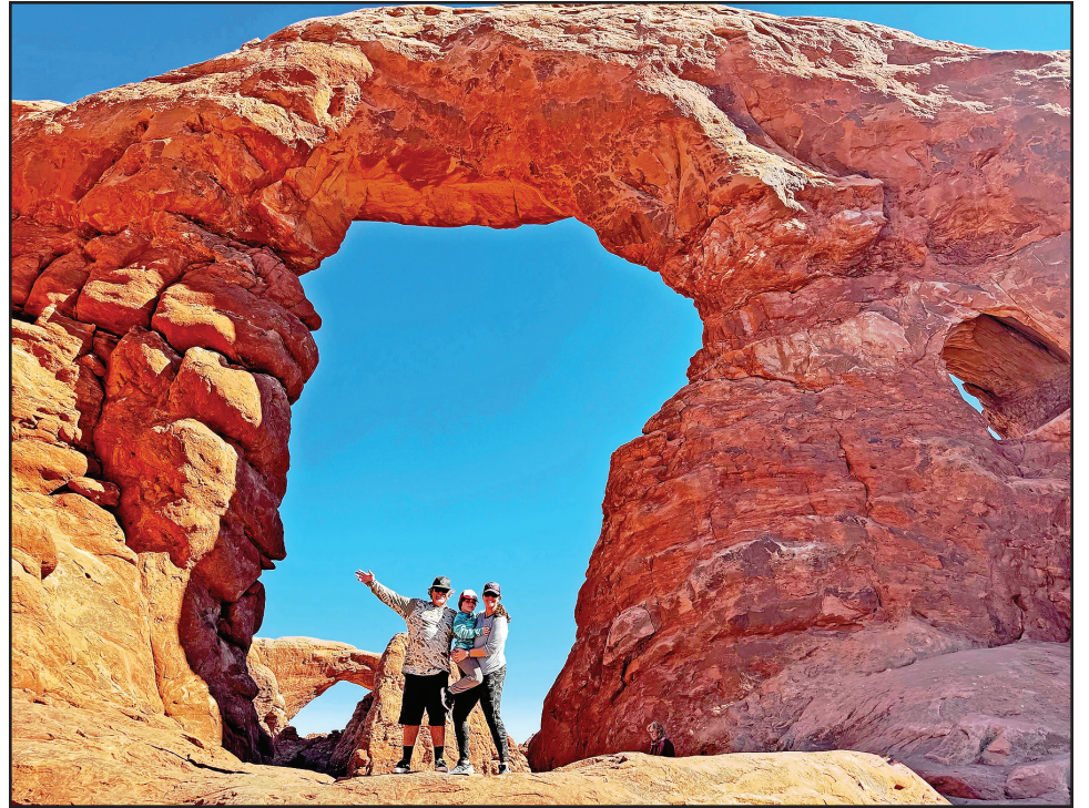
View From The Top: The Fleming family enjoys visiting Arches National Park, which is known for its natural stone arches, towering pinnacles, and massive balanced rocks.