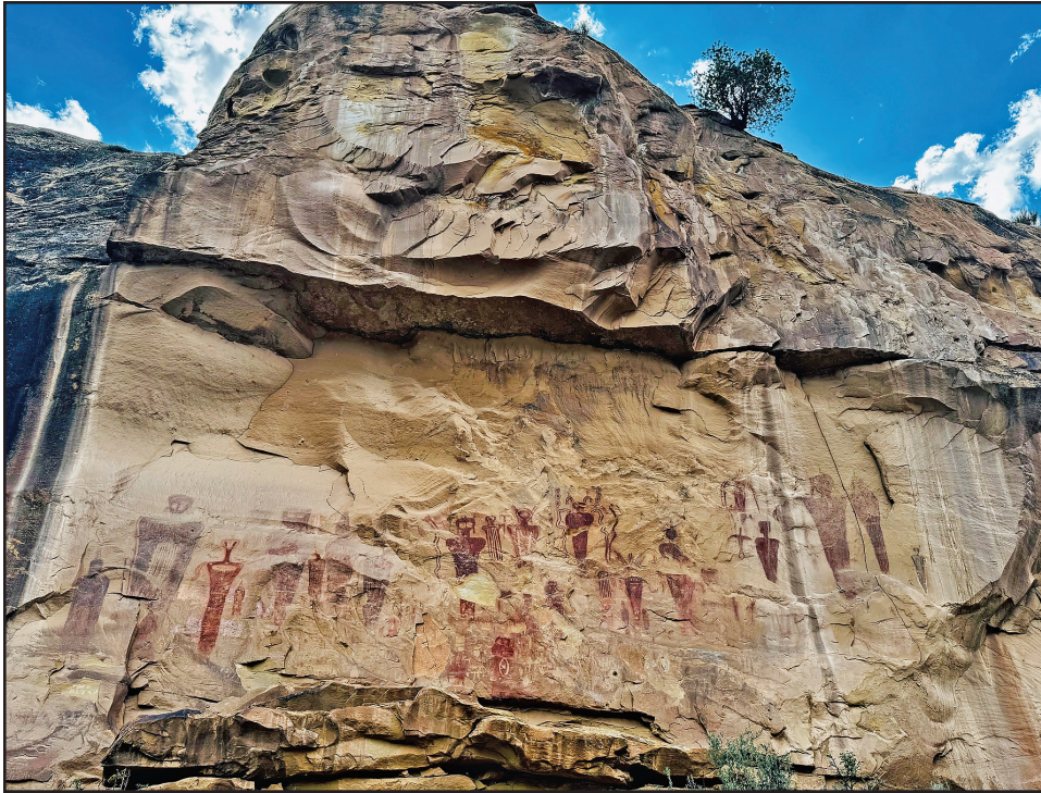
Desert History: Sego Canyon's rock art dates back thousands of years and features multiple cultural styles.

time. Regardless of your chosen itinerary, spring is an ideal season to head west into the desert and see different landscapes and wildlife, enjoy diverse cuisine, explore new terrain, and participate in unique activities.