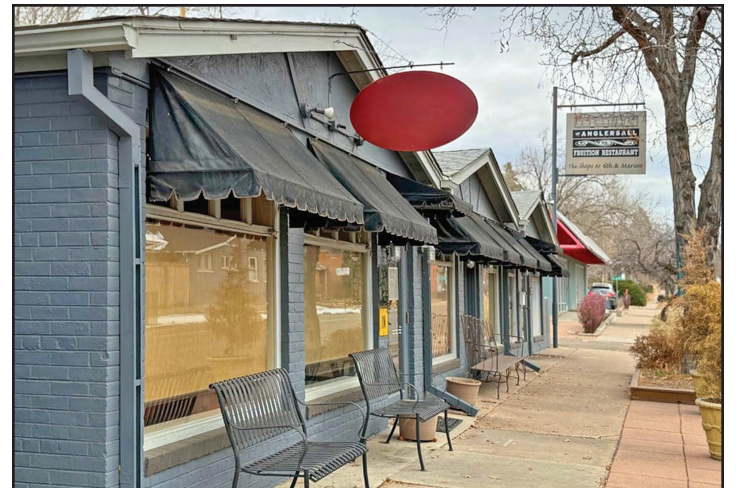
New On 6th Ave.: The former Fruition space on 6th Ave. is re-opening as a new restaurant named Madeline.