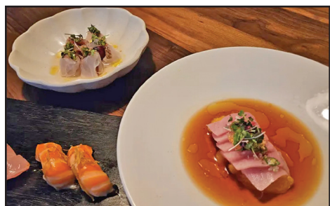
Taste Of Uchiko: Sushi and sashimi with fruit at newly opened Uchiko at Third Ave. and Fillmore in Cherry Creek North.

Located inside the Clayton Hotel , Mar Bella Boqueria brings a Spanish neo-bistro concept to Cherry Creek. The name nods to Barcelona's legendary La Boqueria market, and the menu captures the market's spirit of vibrant, ingredient-driven cooking. Think