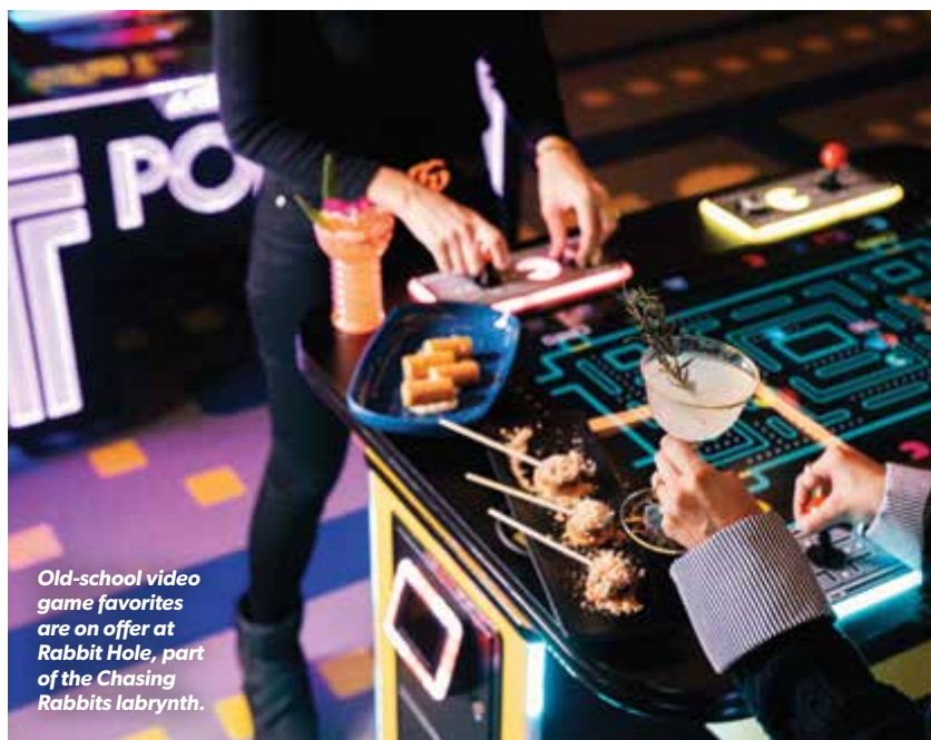
Old-school video game favorites are on offer at Rabbit Hole, part of the Chasing Rabbits labyrinth.