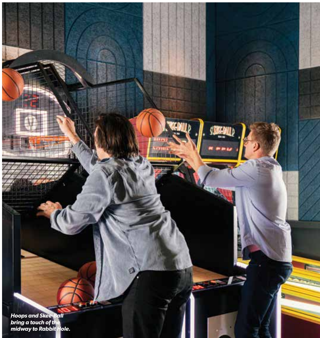
Hoops and Skee-Ball bring a touch of the midway to Rabbit Hole.

CASCADE VILLAGE • 1295 Westhaven Drive, Vail • woodandsteelaxe.com • (970) 445.8155