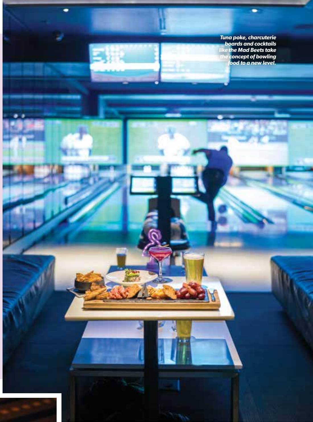
Tuna poke, charcuterie boards and cocktails like the Mad Beets take the concept of bowling food to a new level.

141 E. Meadow Drive, Suite 113, Vail decabolvail.com/bol (970) 476.5300