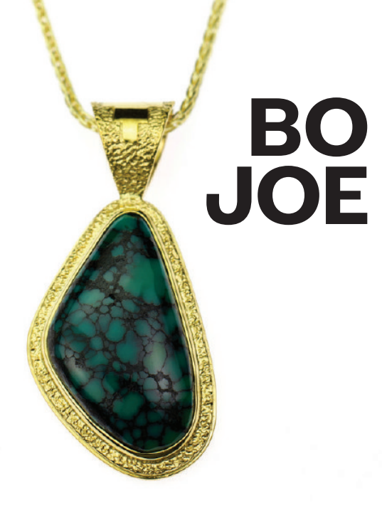
Vintage Spider Web Fox Turquoise Set in 22 Karat Gold