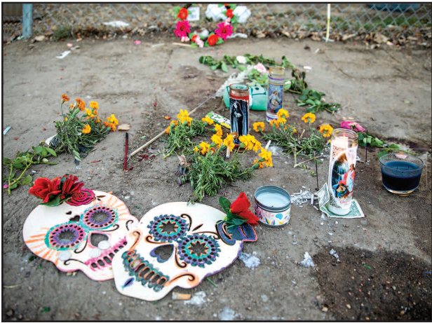
Surge In Violence: is of memorial where six people were shot on E. Colfax Ave. on Nov. 2, 2022.

Denver's violent crime rate has been rising over the last 10 years and especially the last two. Furthermore, police don't believe the pandemic triggered the crime spike. Denver Police Department records show 6,810 aggravated assaults, robberies, and homicides through mid-December, up from just