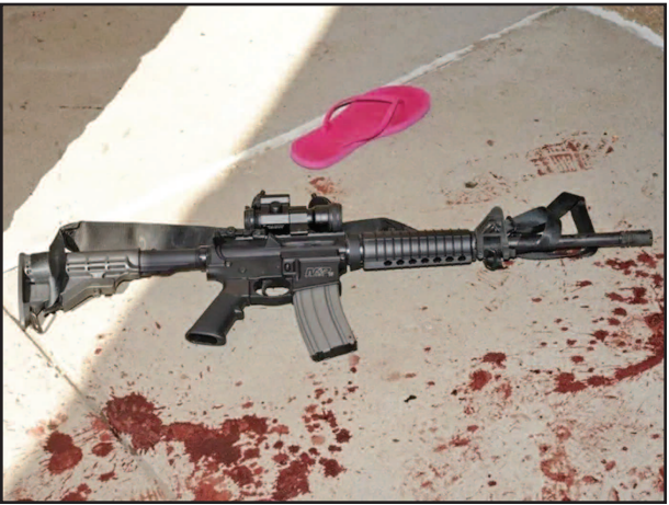
At right, people wielding guns recorded 6,810 assaults, robberies, and homicides through mid-Dec. 2022.

4,924 in 2019. Property crimes during the same period totaled 42,100, up from 26,133 in 2019. Most come from just a portion of the city's 78 neighborhoods. The higher-income neighborhoods located east of Broad-