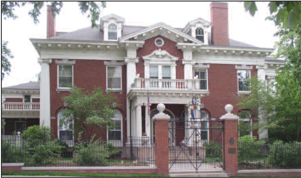
Governor's Mansion: High density developers in Denver are looking for virtually any park or open space they can exploit. Developer AvalonBay hopes to build a 13 story, 305-unit apartment complex at the old Racines restaurant site which would prevent any afternoon light or mountain views for Governor's Park located behind the landmark Governor's Mansion.