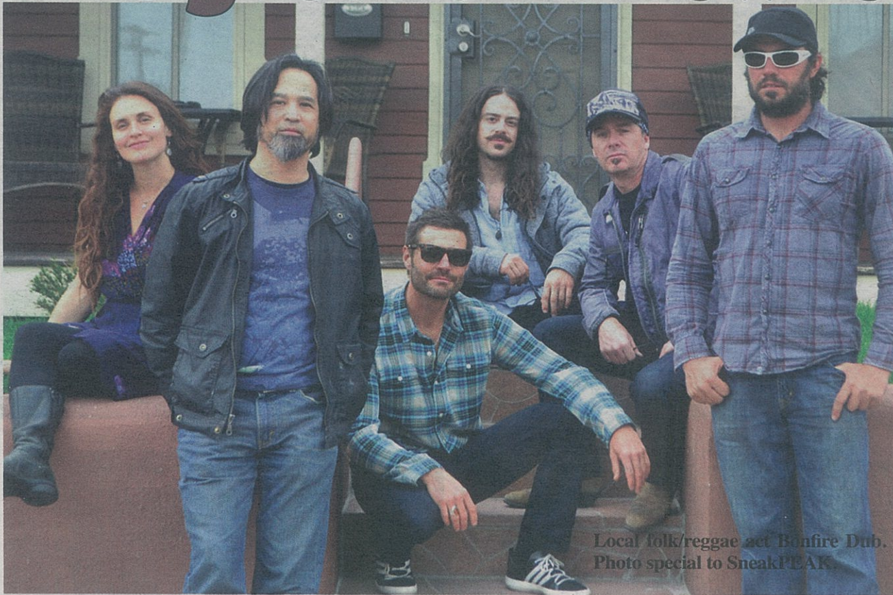
Local folk/reggae act Bonfire Dub. Photo special to SneakPEAK.

Indie music fans, rejoice: Underground Sound series returns to the Vilar Center in time for off-season. By Laura Lieff.