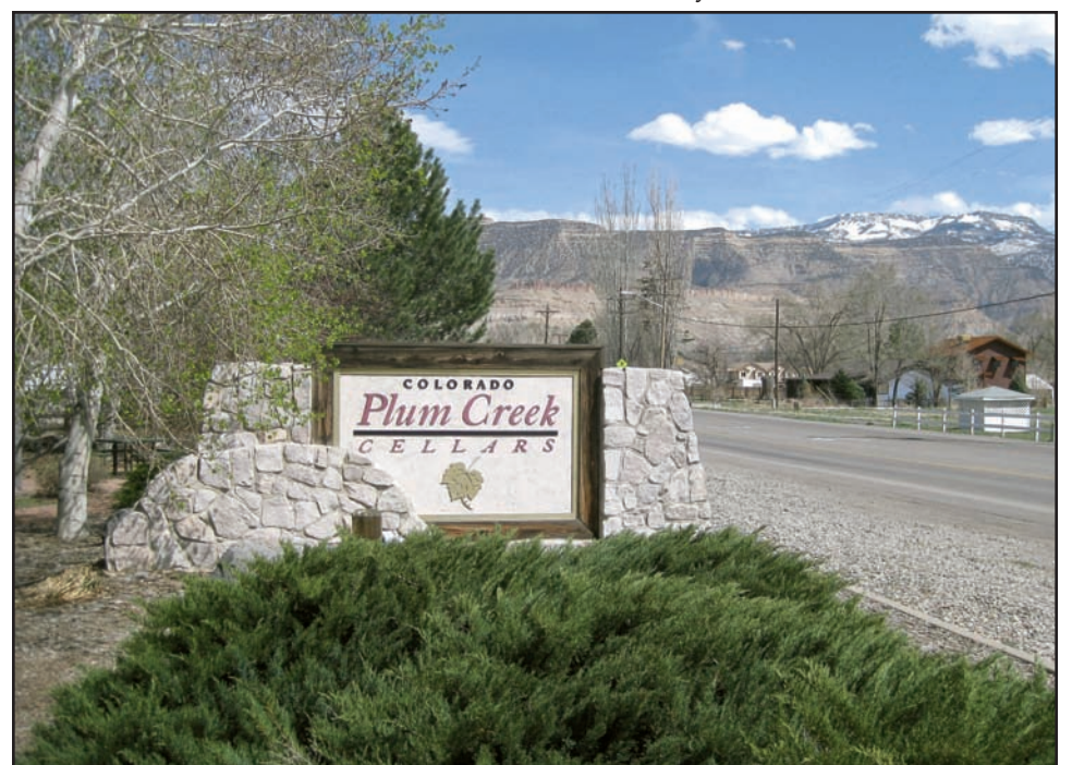
Local History: Plum Creek Winery only uses grapes grown in Colorado and holds Colorado winery license No. 10, the oldest license of all of the state's wineries now in existence.