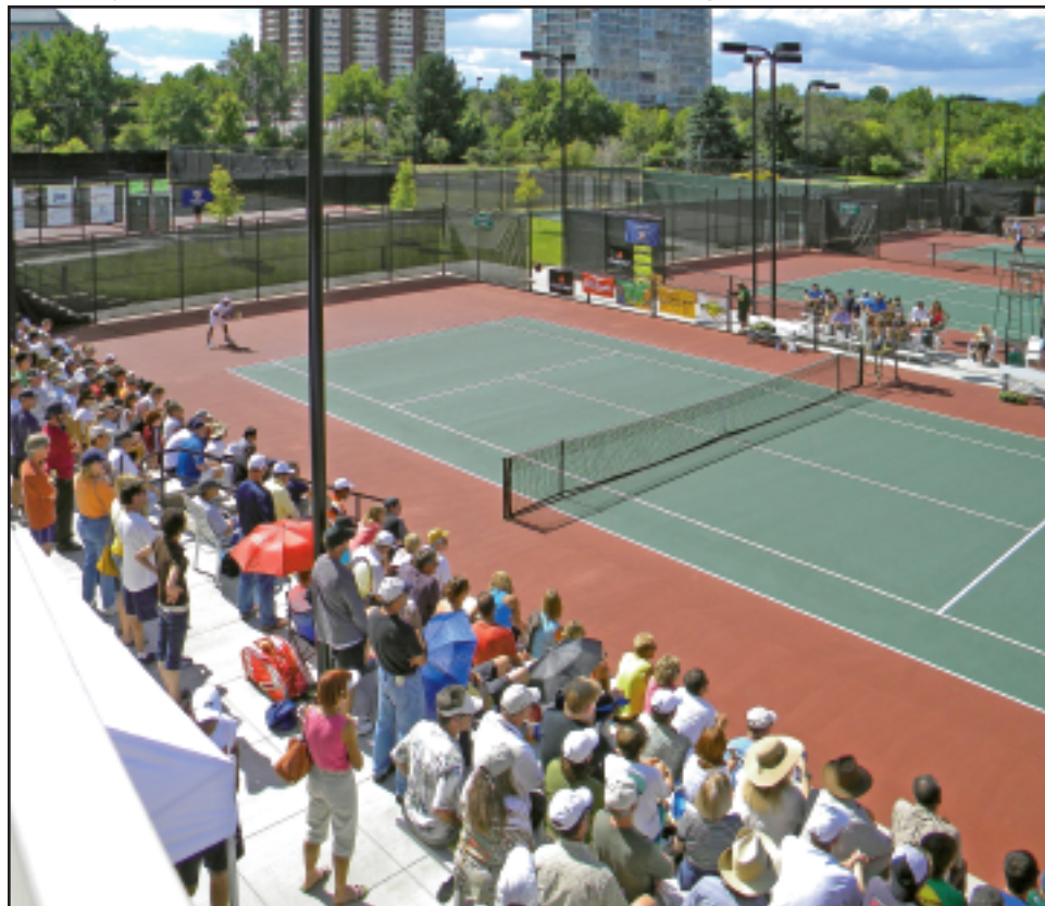
Big Turnout: Over 20,000 Cherry Creek Valley fans gathered to watch the 117th Colorado State Open at Gates Tennis Center.