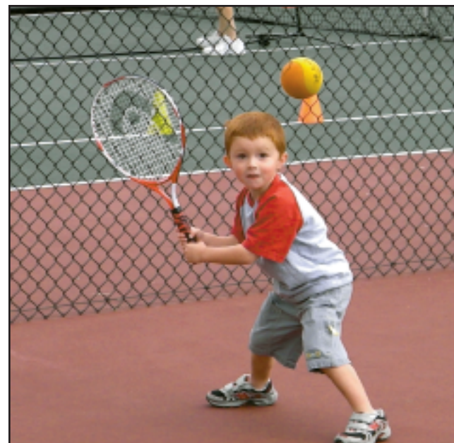
A Day For Kids: One of the hundreds of kids who participated in the Tennis For Kids Day had the opportunity to learn, play and watch tennis with the help of the Gates staff and members of the D.U. and Metro tennis teams.

Kicking off the 10-day tournament, Tennis For Kids Day introduced more than 200 kids to the game of tennis by allowing them to learn, play and watch tennis and win